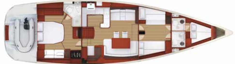
3 cabin version : owner's forward cabin and 2 aft cabins. Optional skipper cabin.