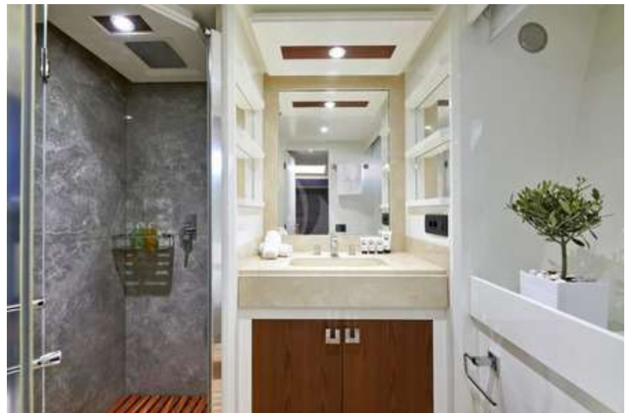
En Suite Facilities