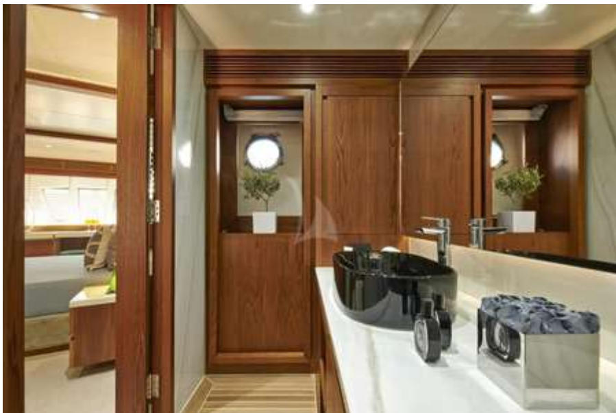
En Suite Facilities