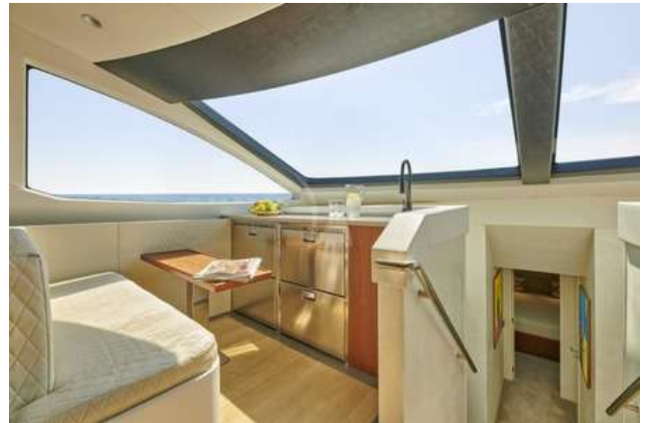
Wheelhouse Sitting Area