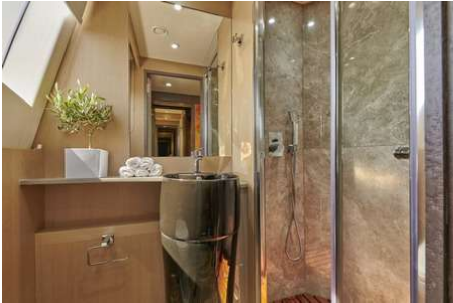
En Suite Facilities