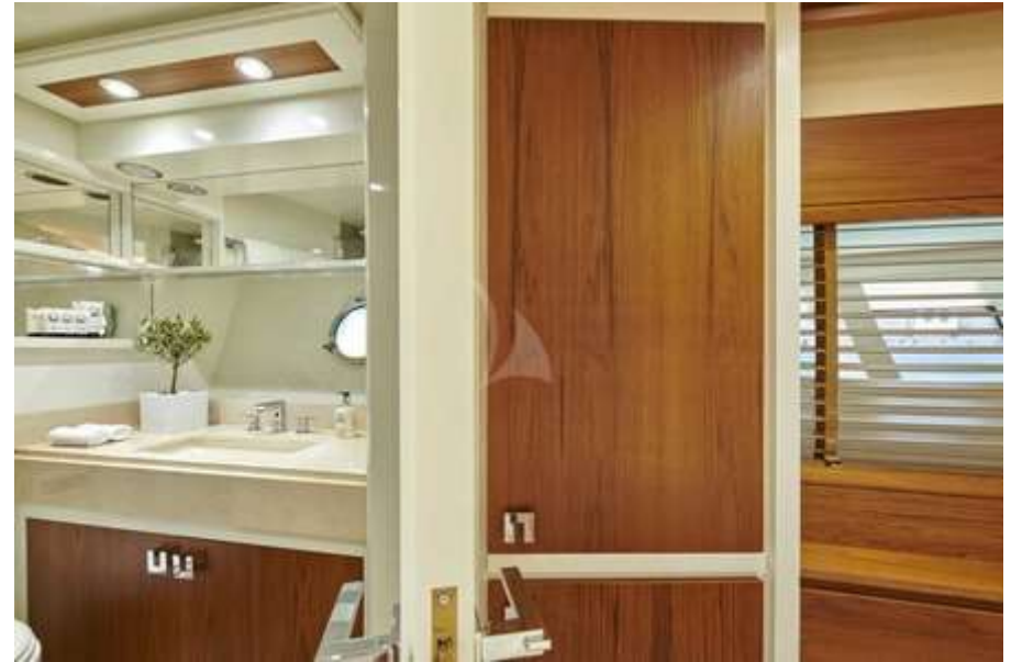
En Suite Facilities