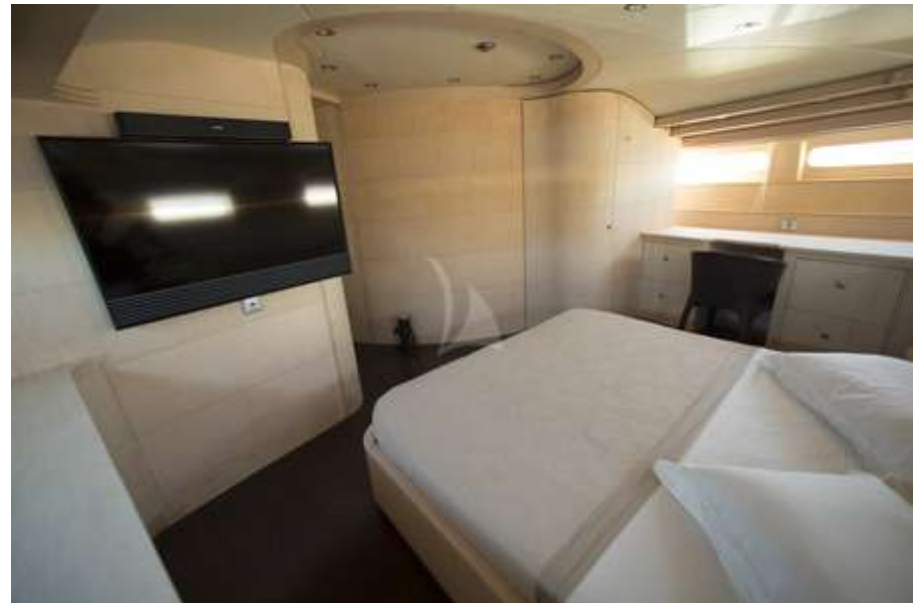
VIP Cabin Main Deck