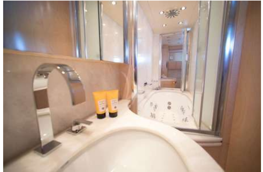
En Suite Facilities (Master Suite)