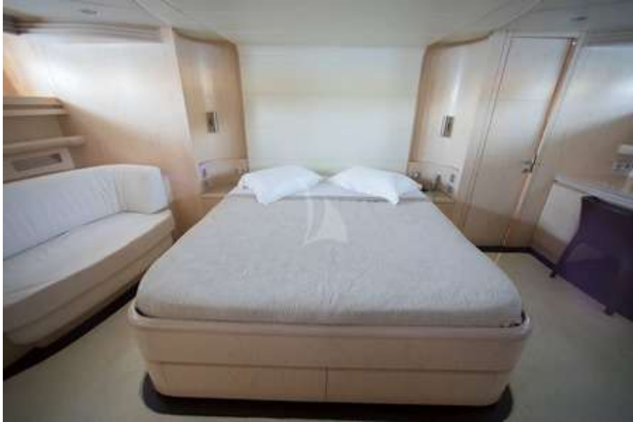
VIP Cabin Lower Deck