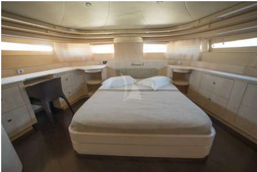
VIP Cabin Main Deck